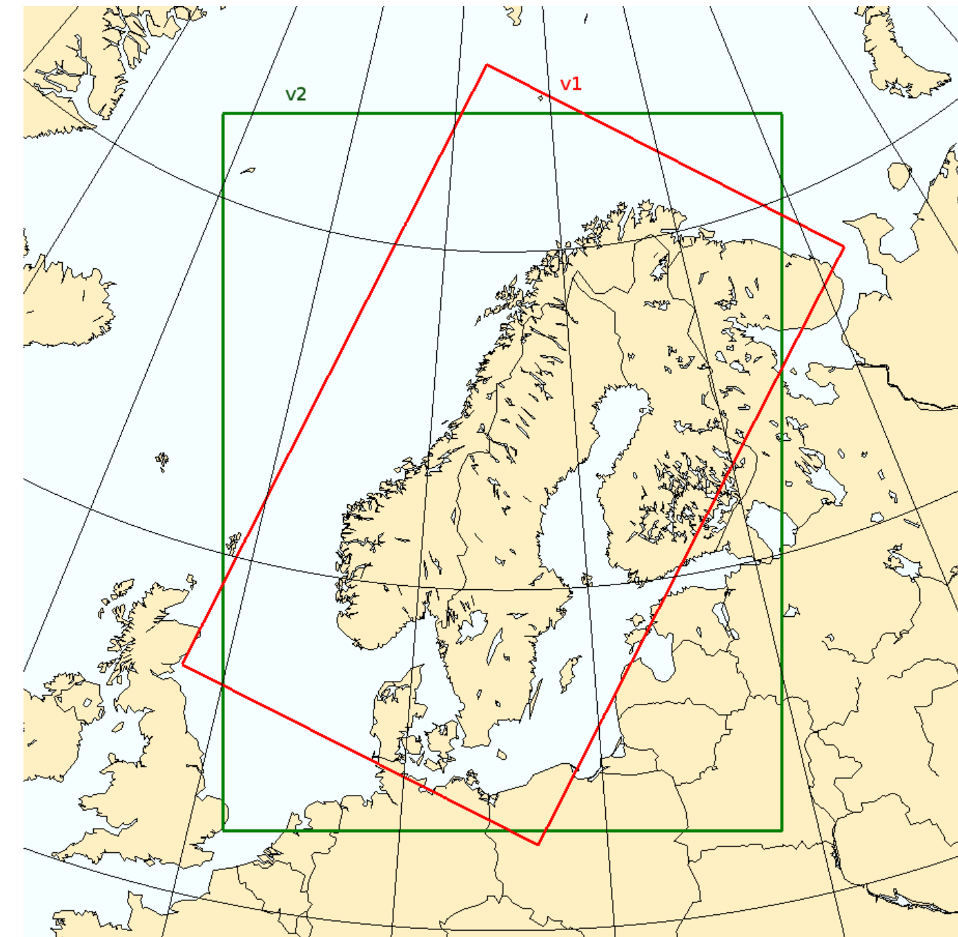
Figure 1. Preliminary model domains for MetCoOp. Both with AROME at 2.5 km horizontal resolution and 65 levels in the vertical. v1: 540x900 points, all tests so far have been made with this domain. v2: 750x960 points, hopefully better suited to a more extensive use of remotely sensed data, i.e., ATOVS, IASI, radar etc. More tests will follow when the new HPC system for met.no is in place in June.

It has been decided that SMHI and met.no keep their existing observation collection systems, including their (different) message switches. Instead, conventional observations collected from both institutes are sent to a common server, where a system for merging, mainly removing of duplicates, has been developed. A similar system is implemented for remote sensing data, both centers send their received data to the common server, where the final processing takes place.