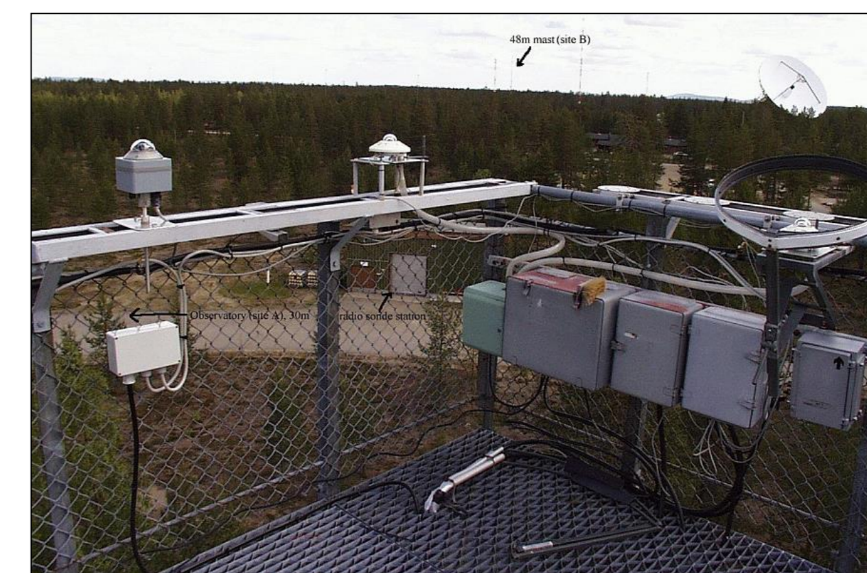
FMI ARC as seen from the radiation tower

Because of various limitations, the comparison period in this example is rather short, so the results may not be generally representative.