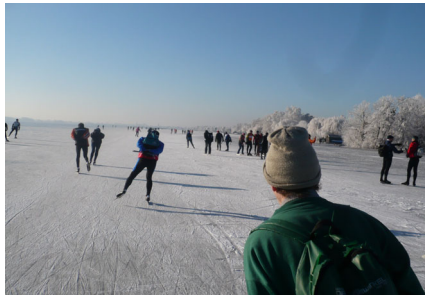
Fig. A: Impression of a frozen lake in the Netherlands.

Ice skating is very popular in the Netherlands. In cold spells numerous ditches, canals and lakes get frozen and many people go out for ice skating tours. In these periods there is a great interest